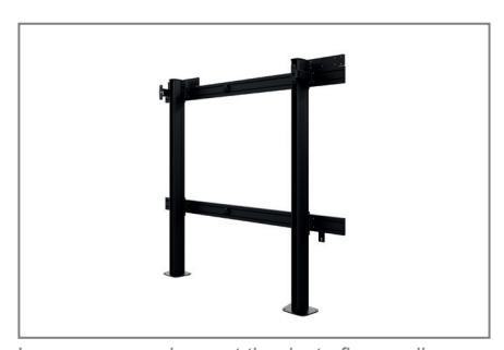
Low space requirement thanks to floor-wall mounting