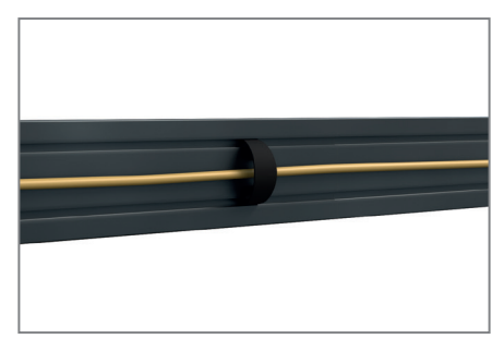
Cable routing with clips

In addition to the pre-configured systems, HAGOR offers customised special solutions in the LED sector, which can be individualised with accessories such as loudspeakers, controls and so on to meet all requirements.