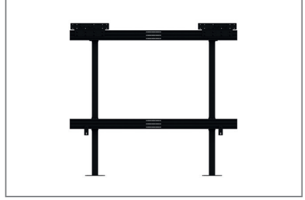
No fine adjustment necessary